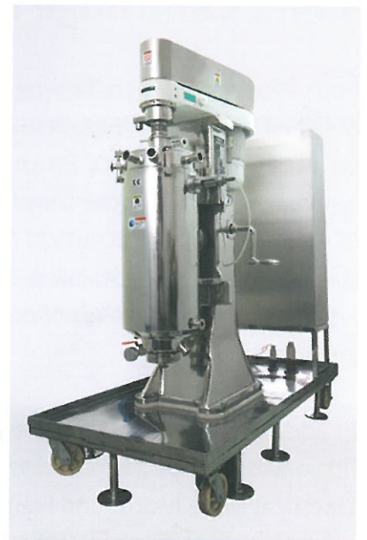
SKID MOUNTED AS 26 VBNF CLARIFIER CENTRIFUGE

This configuration is also available in Model AS16 VBNF